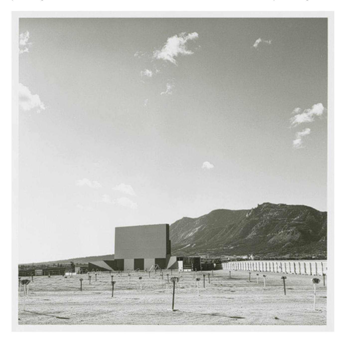
'Untitled" Robert Adams

delirious Metropolis of lawless disorder come to mind. Hejduk claimed to have the 20<sup>th</sup> century's only urban idea; Koolhaas in a moment of humility credited Wright<sup>9</sup>, though he might have equally cited the Soviet disurbanists. During the Big Depression, Wright, suspicious of the city's hording logic, refused to compromise the agrarian, American ideal.<sup>10</sup>. Broadacre offers no space of negotiation.