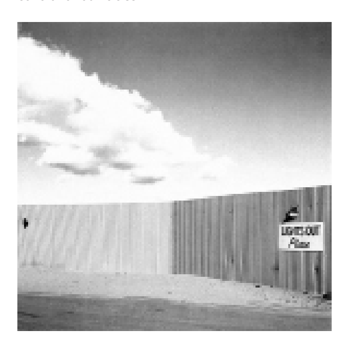
'Lights Out Please" Robert Adams

Subject. Urban Design, negotiating the real, found it's champion's agents in the real estate, property law, the community groups and preservationist.<sup>5</sup> Desiring the promising semiotic ambiguity to be both Duck and Rabbit, it instead was co-opted. It became a study in compromise and deal making, negotiating a bargain to disguise the corporate control of our cities.